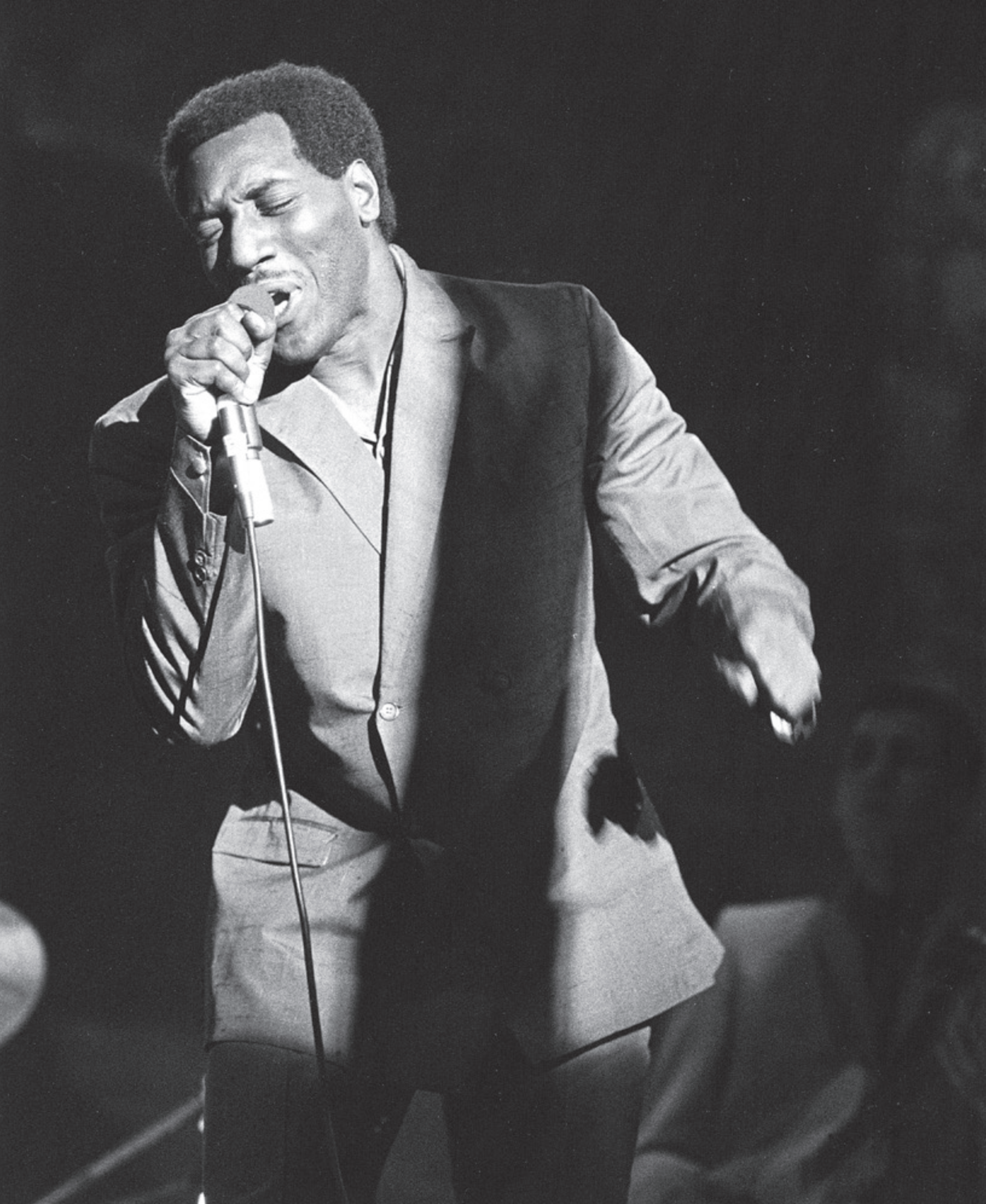
Elayne Mayes, Otis Redding, Monterey Pop Festival, 1967 , digital print, 20" x 16"