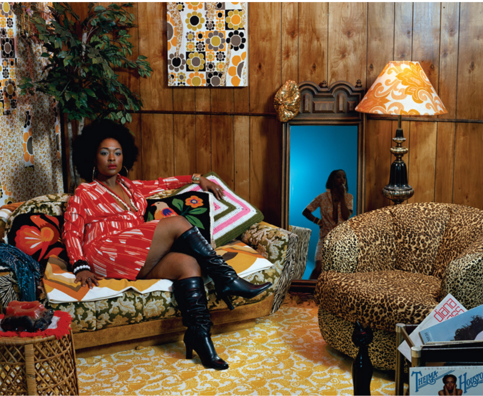
Mickalene Thomas, Sista Sista Lady Blue , 2007, color-coupler print, 37" x 45 3/4"