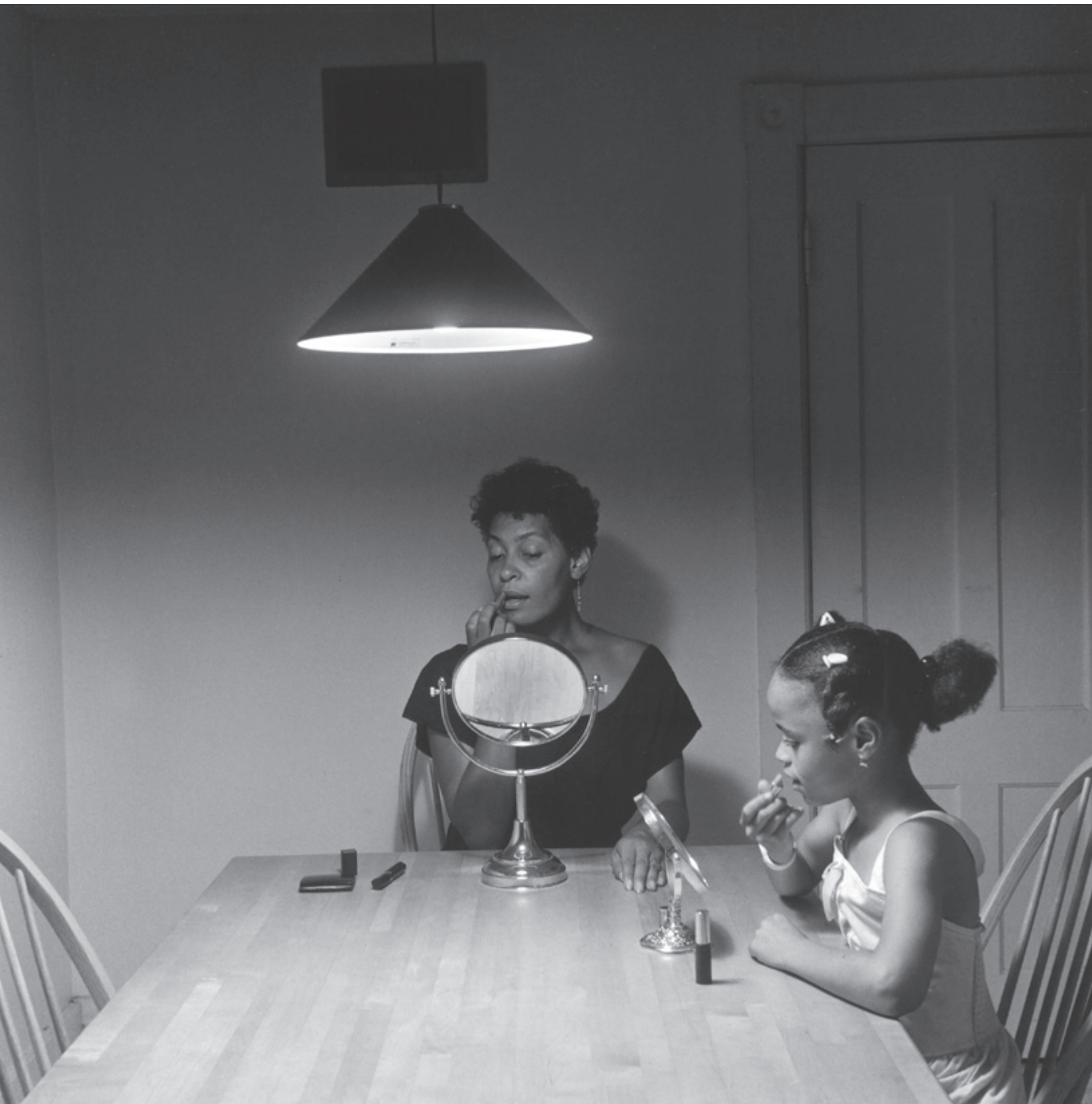
Carrie Mae Weems, Untitled (Man and Mirror) from "Kitchen Table" Series, 1990, gelatin silver print, 25" x 25"