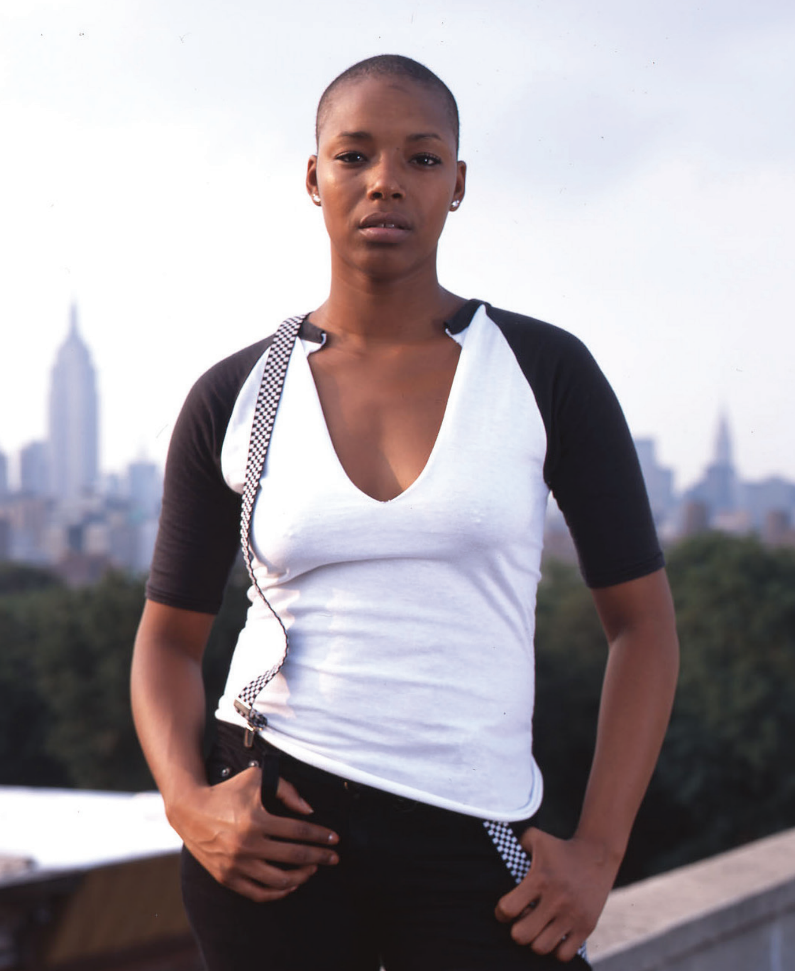
Lola Flash, Sadako , 2008, digital color-coupler print, 24" x 20"