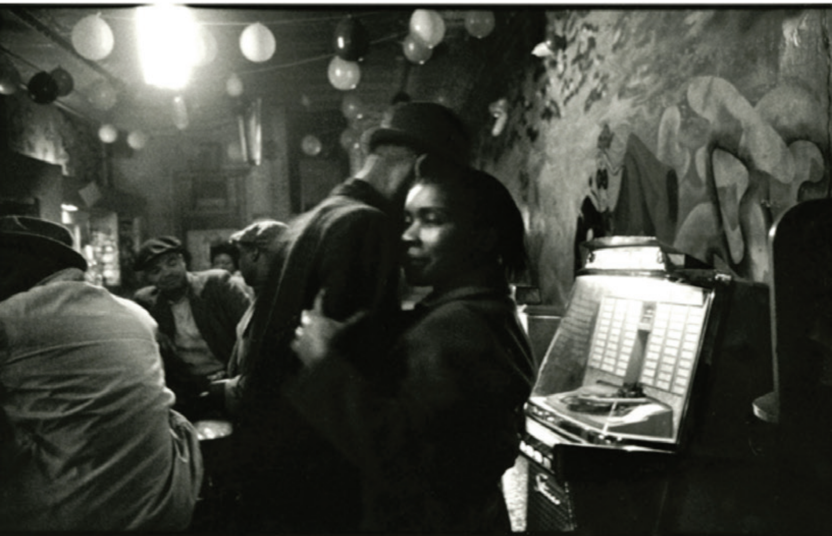
Bruce Davidson, Couple Dancing in Blues Bar in Chicago's South Side , 1962, gelatin silver print, 16" x 20"