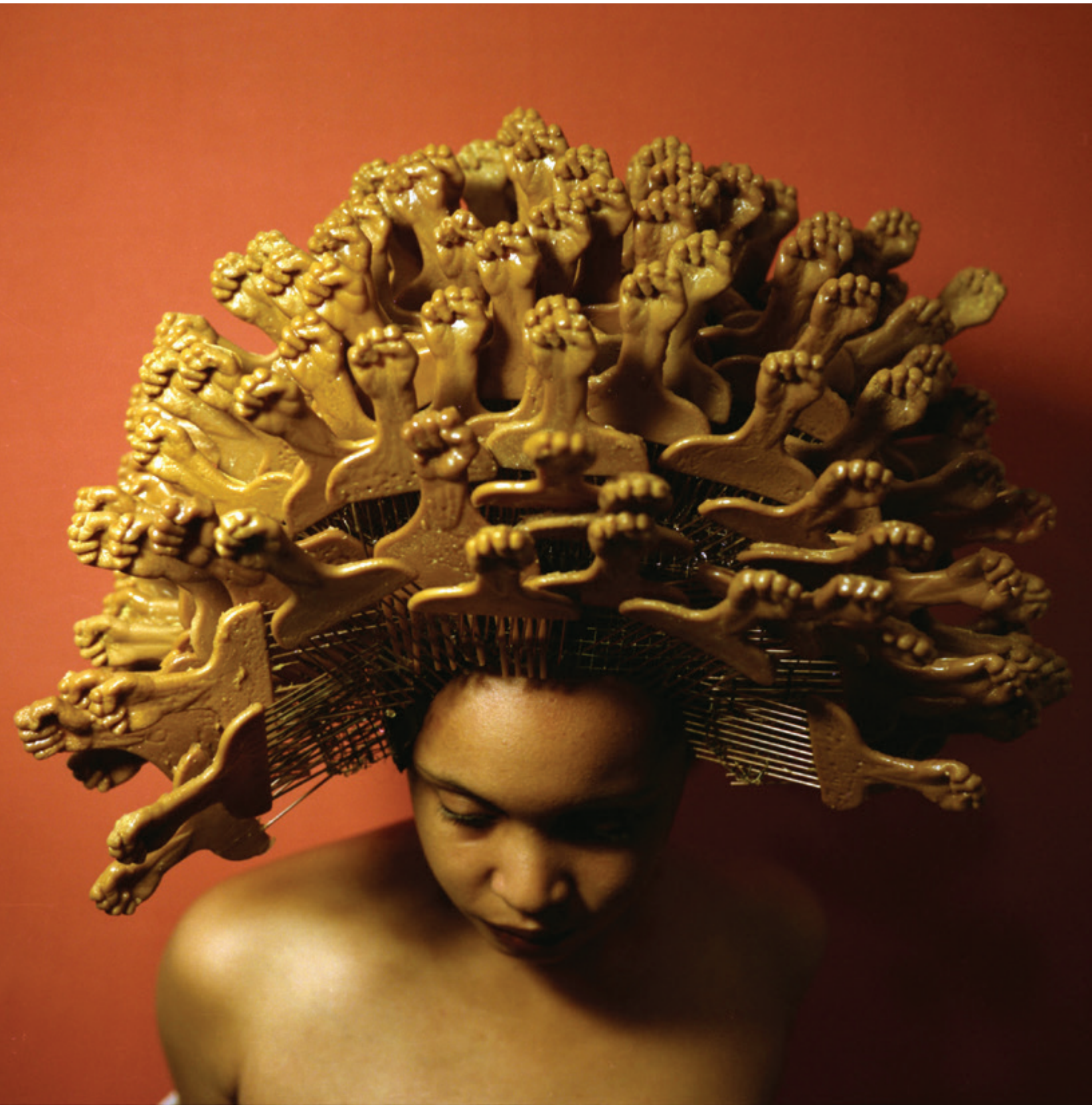
Lauren Kelley, Pickin' , 2007, color-coupler print, 23" x 23 1/8"