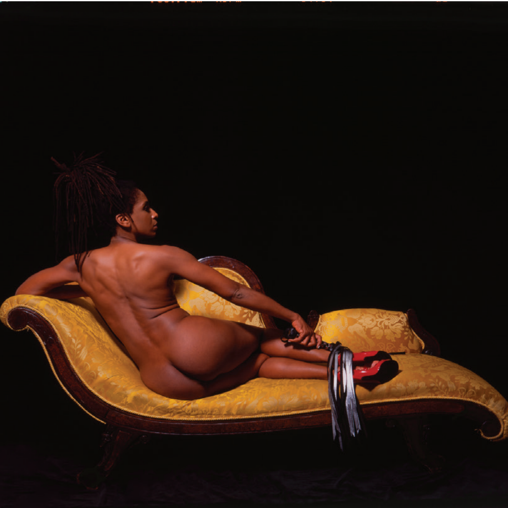
Renee Cox, Baby Back from "American Family," 2001, archival digital print, 30" x 40"