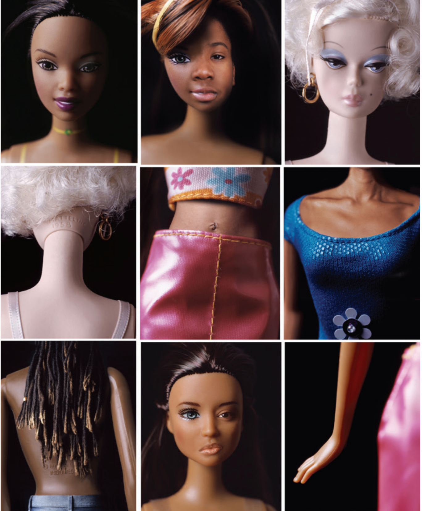
Sheila Pree Bright, From the "Plastic Bodies" Series , 2005, digital print, 38 1/2" x 32"