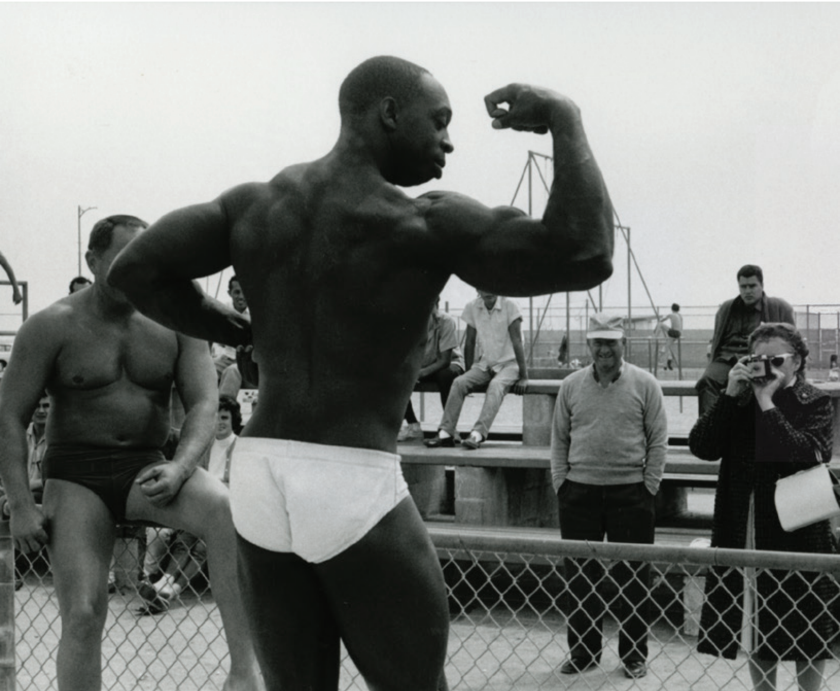
Bruce Davidson, Body Builder on Venice Beach, California , 1964, gelatin silver print, 16" x 20"